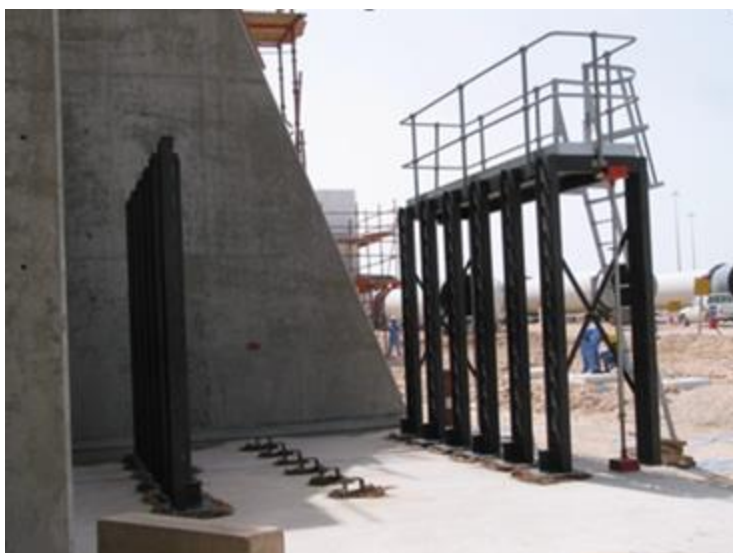
Plate 2–2: Example of a toaster-style storage rack from Flamanville

2.1.82 There will be two storage locations per Unit that will allow mobile cranes to lift the sluice gates from their storage position in the toaster-style storage racks to their guides within the Forebay and Outfall Pond (surge chamber) buildings.